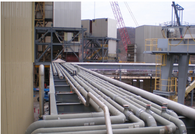
HPPE A-150 in service as CCR piping at a US power utility.