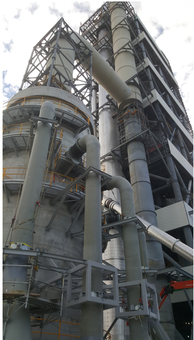
HPPE A-150 in service in a flue gas desulfurization process.

For recommendations on accommodating thermal expansion, refer to RPS Design Manual . For information on conducting a pipe stress analysis of A-150 piping, refer to RPS Doc. No. E--433 , available from our Engineering Department.