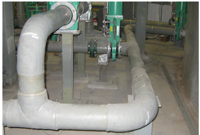
HPPE A-150 in service as FGD process pipe at a US power utility.